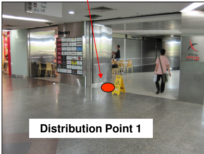
Distribution Point 1