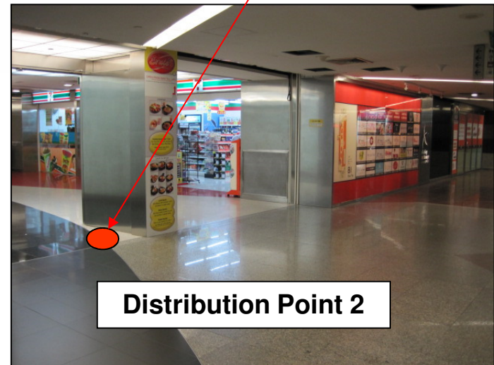
Distribution Point 2