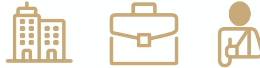
Public Liability Insurance