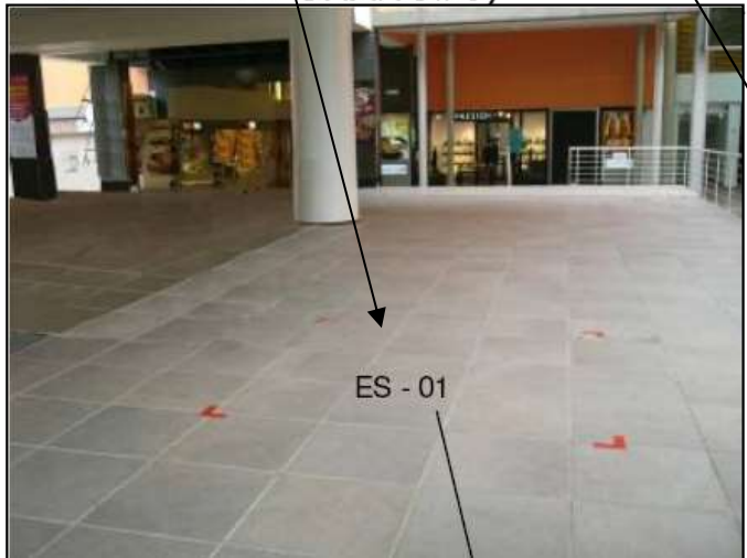
Distribution point 2 (exit of fare gate)